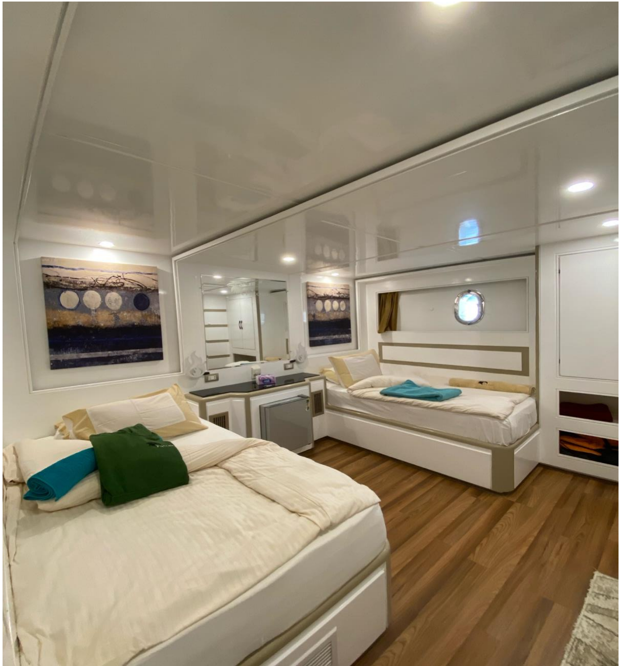
Twin cabin lower deck