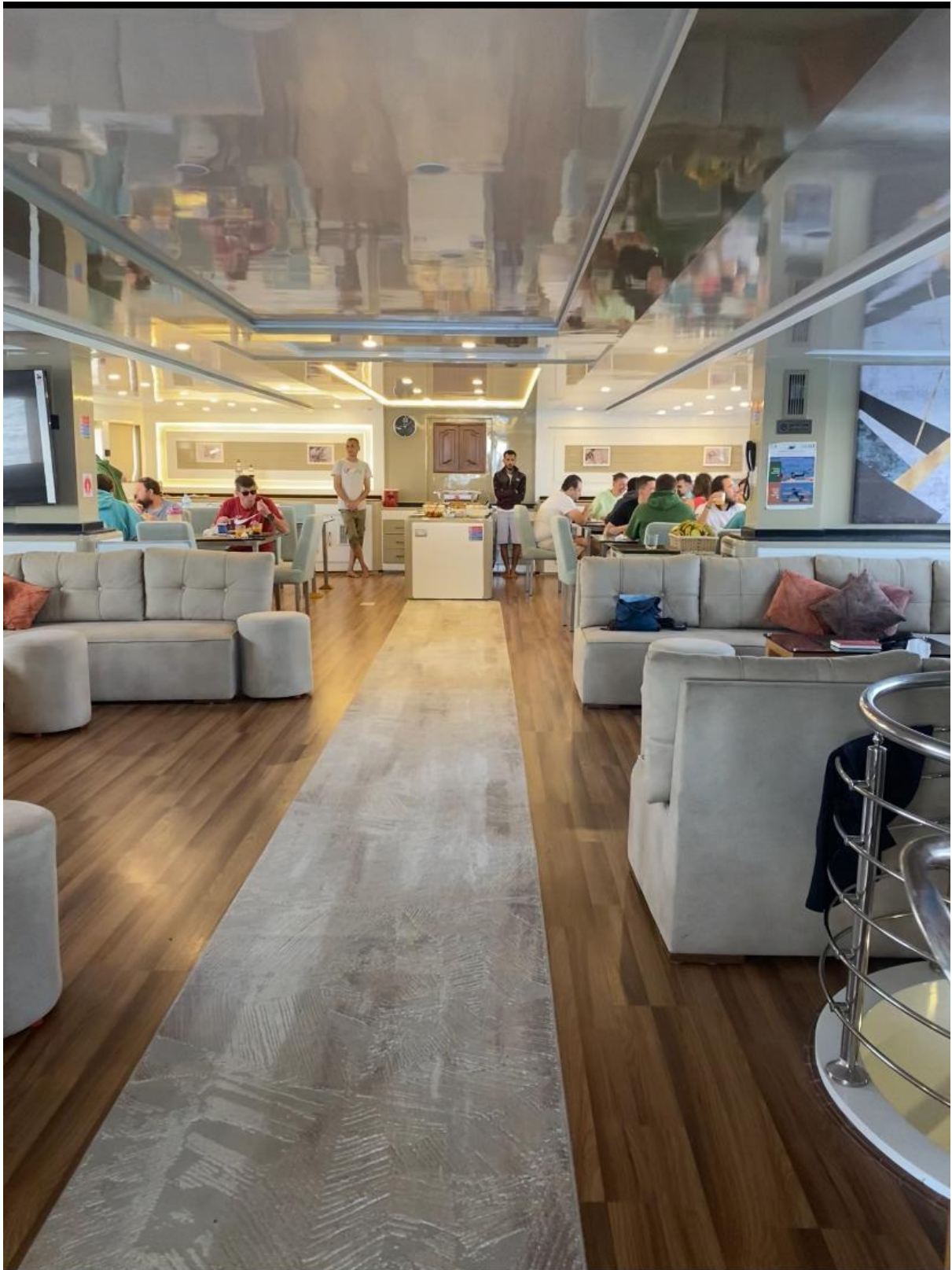
Upper outside deck